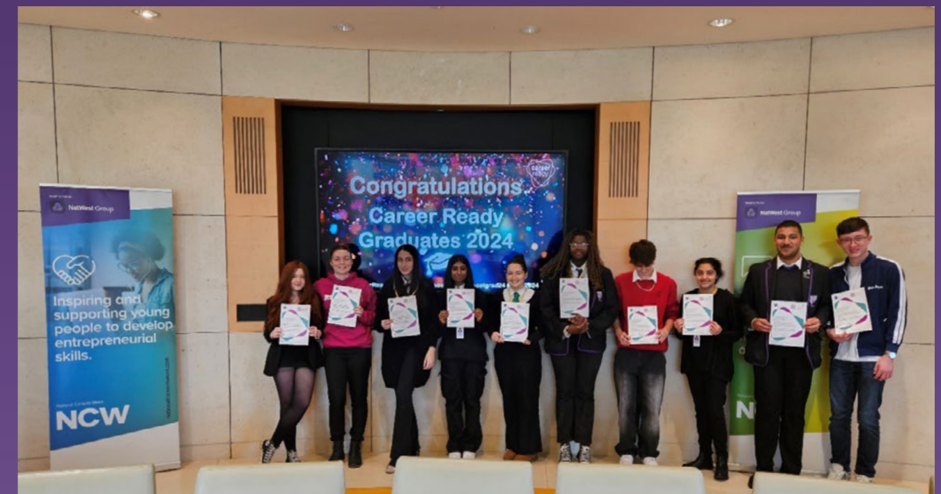
(Career Ready students who received their graduation certificate at Gogarburn)