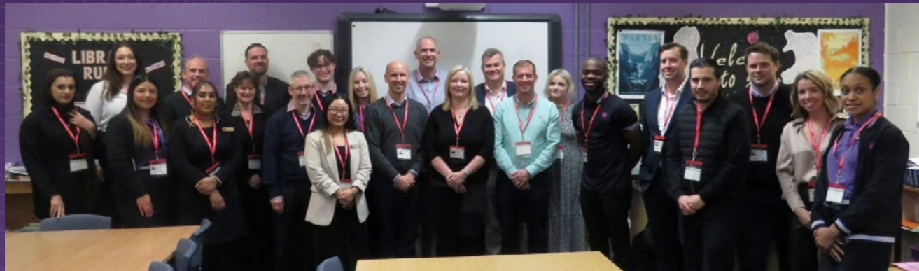
(Natwest Group volunteers who delivered the "super event" at Cantell School)

NatWest Group also supported a STEM careers event in Edinburgh. Dynamic Earth hosted 'Your Planet Your Future Careers Day' to 600+ students. The stall received some great engagement from career leaders and young people and they day was a great success!